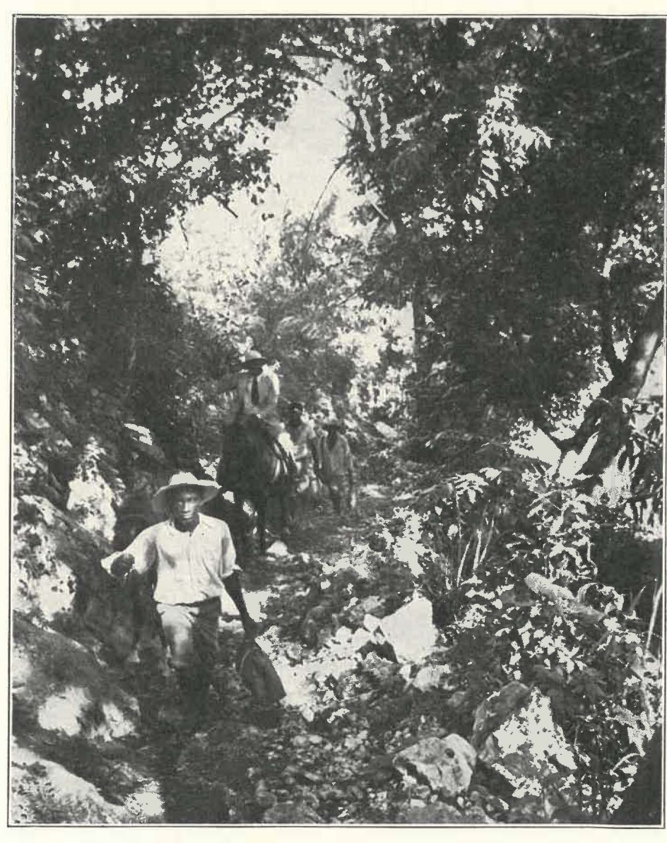
HAITIAN PEASANTS ON THEIR WAY TO CHURCH (See page 6)