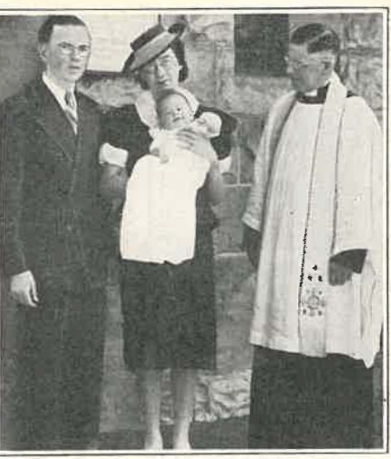
Rocky Mountain News

Secondly, may we not learn to be as intelligent and reasonable as our Roman brethren in our reverence of the altar? They never genuflect except before the Reserved Sacrament, while many of us bend the knee at the entrance of the pew in all cases. Let us always stop and bow the head and thus recognize our most holy place, but only genuflect before our Lord in the most Holy Sacrament. Are so many of us so unobservant or so careless as not to pay attention at such a moment? Let us remind ourselves that ritual