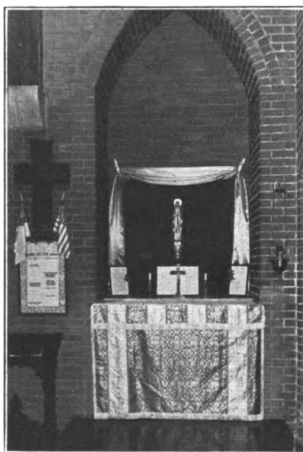
LADY ALTAR AND PEACE SHRINE: St. Paul's Church, Savannah, Ga., placed its roll of honor beside the new altar dedicated to the Blessed Virgin Mary. Over a score of the communicants are serving in the armed forces of the nation.

"We recognize that the world is in a state of theological, economic, and political revolution. As a consequence, many national and world adjustments must be made to meet the situation with a view to bringing about a just and durable peace. To meet this problem we agree that national isolationism has proved ineffective, and that therefore there must be substituted some form of international government with democratic control where the sovereignty resides in all the people of the world regardless of race. To achieve this control, certain definite sacrifices must be made by all nations. Such sacrifices will have to be made in the following fields: trade, tariffs, currency control, allocation of natural resources and political and social organization. We recognize that such changes will involve real readjustments but should not be so rapid as to result in violent revolution which might destroy all possible gains. Relationships among nations have always limited national sovereignty as, indeed, it is inescapably limited by the sovereignty of God. The task of the Church is to lead in the development of an