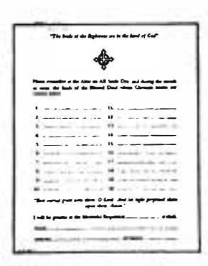
Size, 5\frac{1}{2} \times 6\frac{1}{2} inches

A form to be distributed to members of the congregation for recording the names of those to be remembered at the altar on All Souls' Day, and during the following month. Space is provided for twenty names.