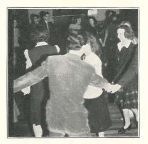
At Trinity, Bridgeport: War workers as well as service-men are cared for in Connecticut's wartime set-up.

On a map covering two full pages in a recent issue of a popular magazine, large red dots designate the chief war industry centers of the country where manpower and woman-power are at a premium. Four of these dots in a row form a straight line through the state of Connecticut, showing it to be the most concentrated defense industry area in the entire country. Each of the four cities indicated, and many other communities within the diocese, are filled to overflowing with defense workers who have come from all sections of the country. Figures show that the total number of employees in the state increased 72.5% from 1939 to July 1, 1942, and in some communities the increase has been as much as 863%. Figures dealing with the employment of women in industry reveal increases as high as 1100%. These and other war-time factors are making for radical social changes in Connecticut