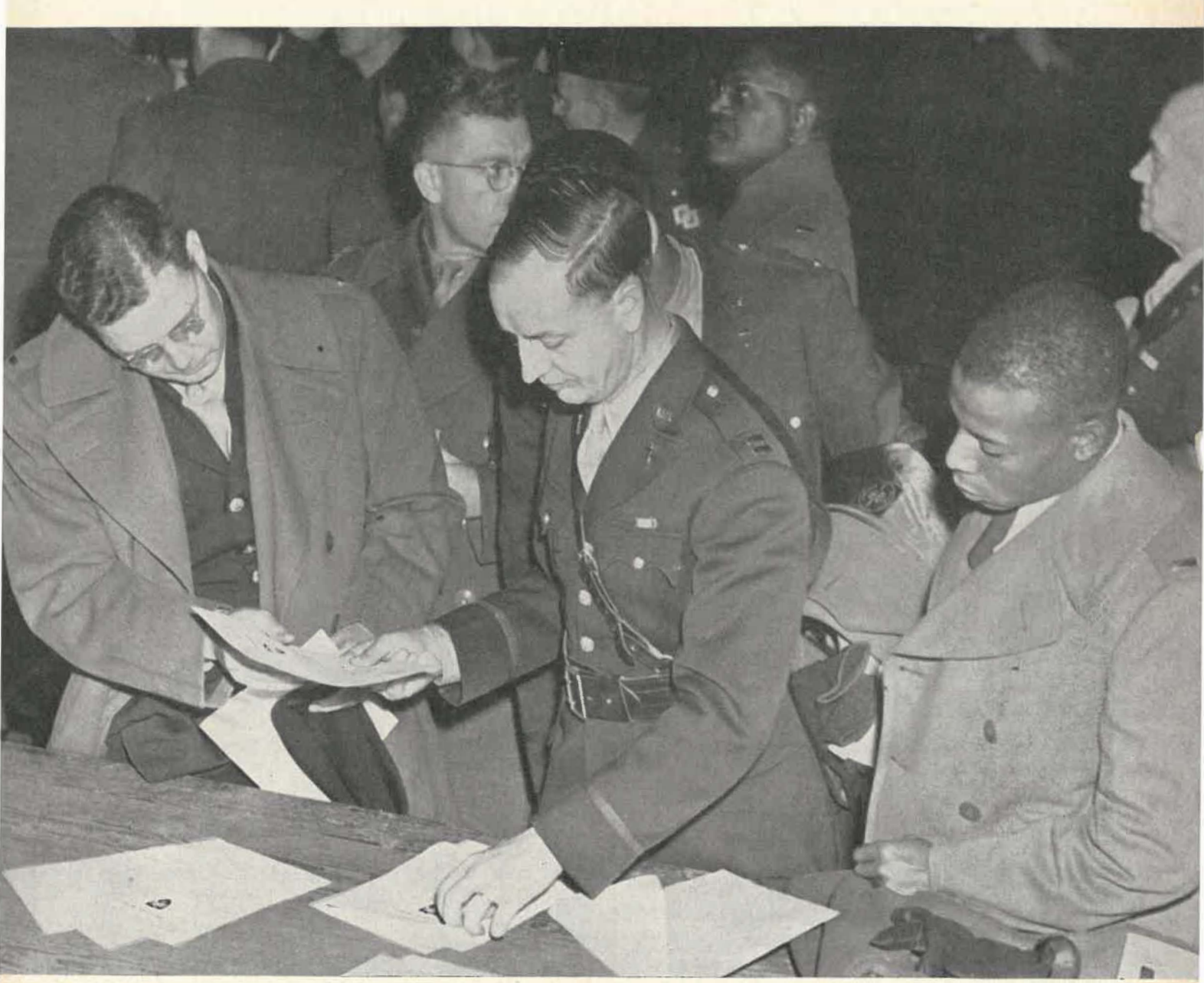
ARMY CHAPLAINS RECEIVE THEIR DIPLOMAS

A weekly record of the news, the work, and the thought of the Episcopal Church