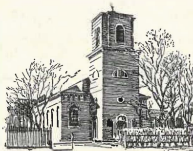
CHRIST CHURCH, CAMBRIDGE, MASS.