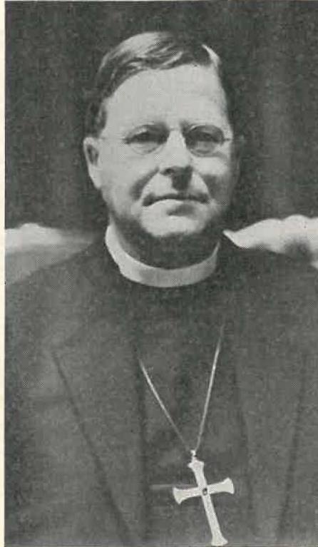
DR. TEMPLE: Called for a political awakening among Christians.

"3. The fundamental duty which man owes to God is reverence for the world as God has made it. Failure to understand and acknowledge this is a principal cause of the present ineffectiveness of Christian witness in relation to the temporal order. The first grave error characteristic of our time is a too-exclusive occupation with policies to the neglect of other equally important spheres of human life and activity. It is forgotten that man is not a being