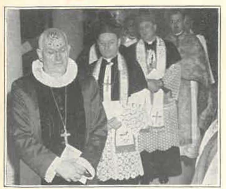
VISITING BISHOPS: The Primate of Iceland and dignitaries of other

"Those of us who know you will realize with what deep regret you leave the special work of training men for the ministry of the Church. Because this is so vital in your eyes, I feel certain that in this new office you will find many opportunities to further this same great cause. Out of