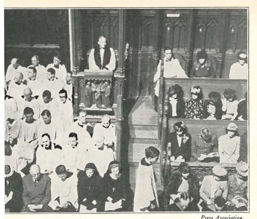
NSTALLATION: The new Bishop is seated in his chair in the choir. The catheunique in that it also has a chair for the Presiding Bishop.

id Father in God, we present this godly and well-learned man, lained and consecrated bishop."