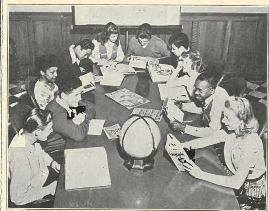
RACE RELATIONS SUNDAY: Inter-racial study groups such as this one are urged on Race Relations Sunday, February 10th, as a part of Brotherhood month, held during February to promote interfaith and interracial understanding.

justice might not perish from our earth." In the domestic field "some of the evils we hoped had been destroyed in the crucible of war, now reappear with aggravated malignity. As a nation we are morally at peace with gambling on a fantastic scale, and the problem of drink is becoming ever more formidable. This is not the musing of a misanthrope. America needs a spiritual revival, else our churchly activities are irrelevancies in the current scheme of things, and we will dip into a period of decadence resembling that which followed the first World War.'