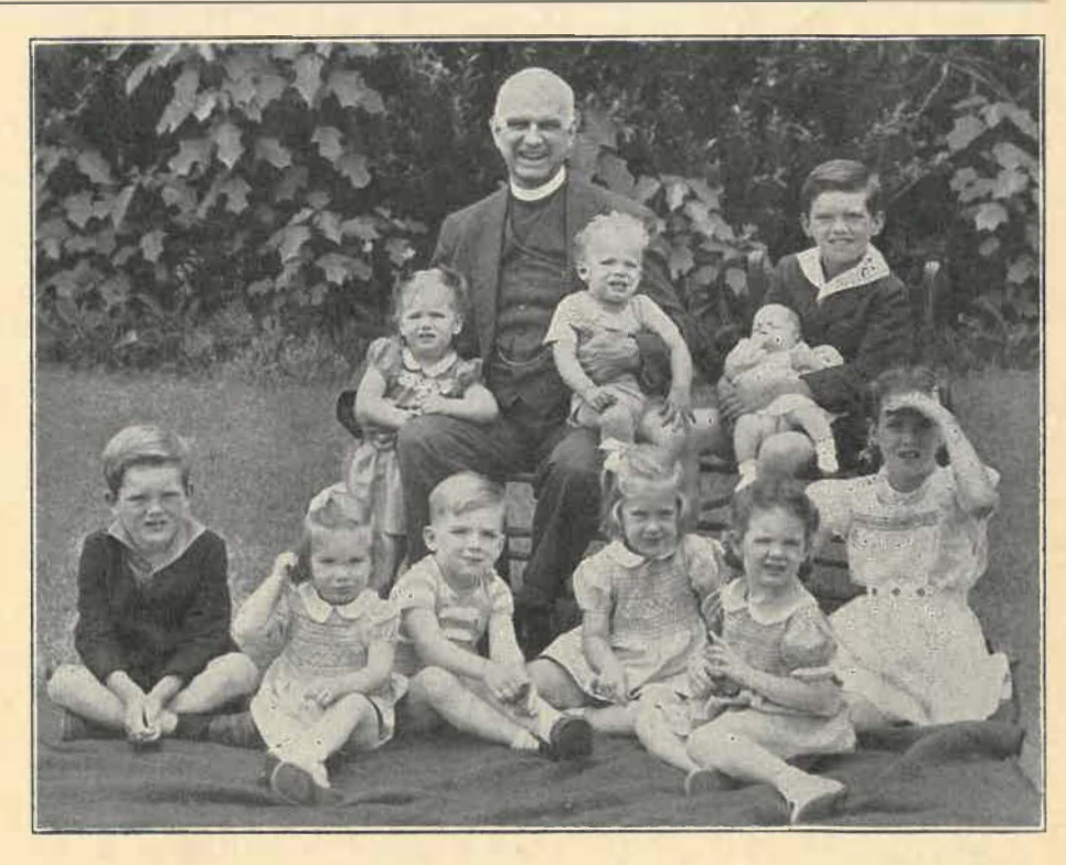
THE LATE BISHOP STEVENS OF LOS ANGELES: The Bishop is shown here in a photograph, taken in 1944, with his grandchildren, four boys and six girls.

Subscription $6.00 a year. Foreign postage additional.