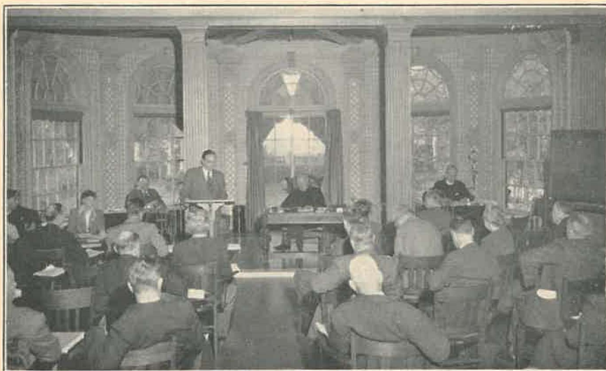
MEETING OF THE NATIONAL COUNCIL: The above picture was taken at the December meeting. The Presiding Bishop is seated at the desk in the center.

"Resolved, that in the light of the rapidly changing conditions affecting the education of Negroes for the ministry of this Church and the graduate education of Negroes generally, the National Council communi-