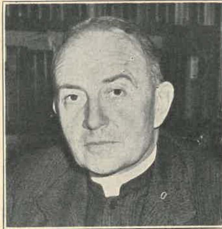
BISHOP DUN: Opposed authorization of translations of the Prayer Book.

"The action of General Convention on the Spanish Book and the Portuguese was not the same. The authorization of the Spanish Book was done by the House of Bishops, mainly. They were very specific about it. The Cuban edition is like the Standard Book. In the Panama Canal Zone, they use the Cuban Book, with no