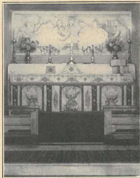
Church of St. Michael and All Angels Baltimore, Maryland