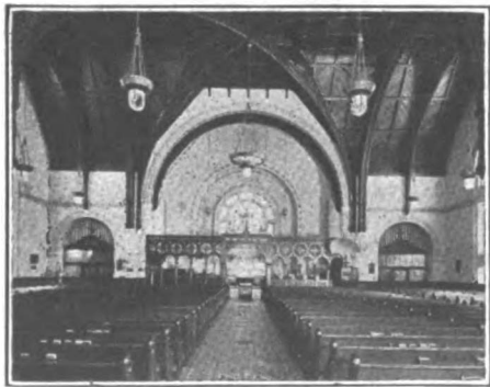
CHURCH OF ST. MICHAEL AND ALL ANGELS BALTIMORE, MD.