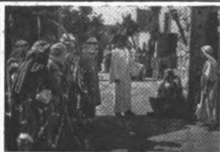
"Blind Beggar of Jerusalem"