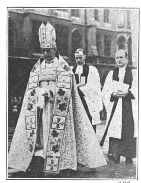
LAMBETH Scenes: (Above) the Archbishop of Canterbury in vestments presented by Japanese Church; (left) the reception at Lambeth Palace.