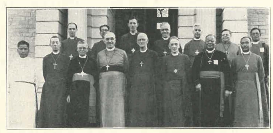
CIBC: Bishops and Metropolitan at General Council.

Other matters undertaken by the Council included the revision of the