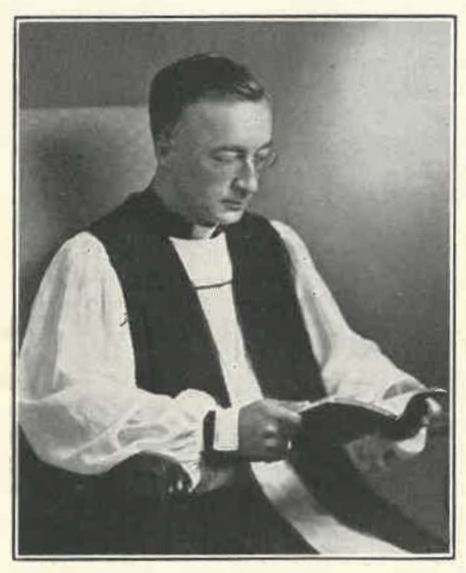
.BISHOP EMRICH: No chocolate soldiers.

In spite of inclement weather, carloads from the following places were present during the three evenings of the mission: Portland (all parishes), Saco, Biddeford, Sanford, Auburn, Lewiston, Brunswick, Bath, Camden, Newcastle, Northeast Harbor, Rockland, and Wiscasset.