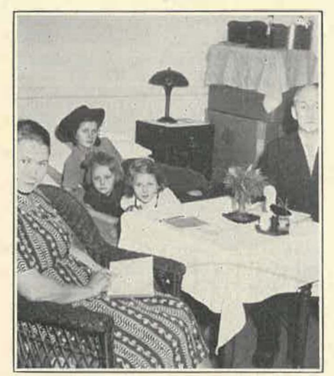
Boston Sunday Post BALDWINVILLE D.P.'s: First American home.

The displaced persons at the resettlement center are technically wards of the United Nations. The UN pays their passage to New York. From then on the Committee pays all expenses until they are settled and self-supporting. The Committee relies on voluntary help, both