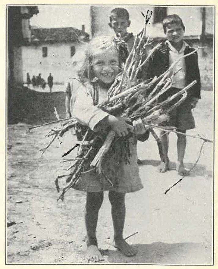
GREEK CHILDREN: ... that they may be counted worthy of the kingdom of God, for which they also suffer.

The World Council of Churches, we found, is the only voluntary agency operating in Greece whose function is to promote the welfare of refugees and to assist in resettlement. An official IRO report notes that "with a very small staff, this agency has, in a brief period, been able to distribute supplemental food to groups especially in need, to engage in a limited amount of individual case work, to direct the attention of government officials to especially acute situations, to promote better camp maintenance by