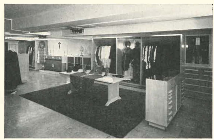
Vestment Department of our New York store.