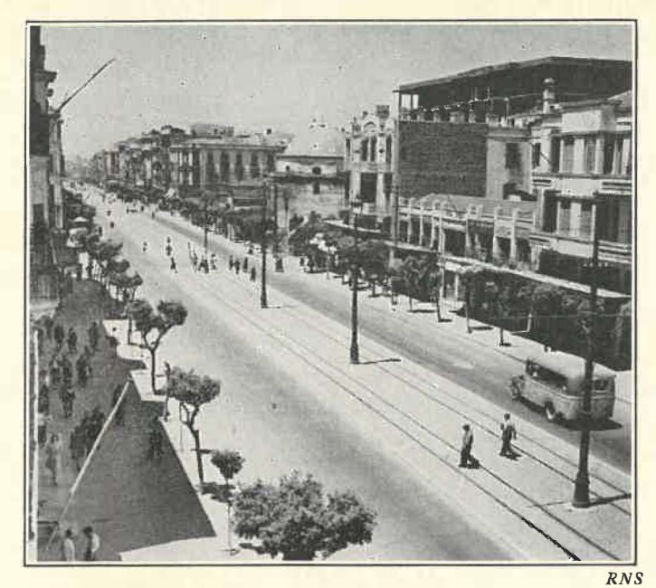
SALONICA: Today as 1900 years ago, patience and faith in all persecutions. . . .

us to see some of the works. These included a vocational school, with training in such trades as carpentry, shoemaking, and printing; a deaconess training center, modelled on the Anglican plan observed by Fr. Barnabas in England; and one of the orphanages under its auspices. This work, which constitutes the "home missions" program of the Greek Church, is a hopeful and encouraging sign of the forward-looking efforts of the leaders of the Church to adapt its sociological and religious program to the needs of contemporary Greek life.