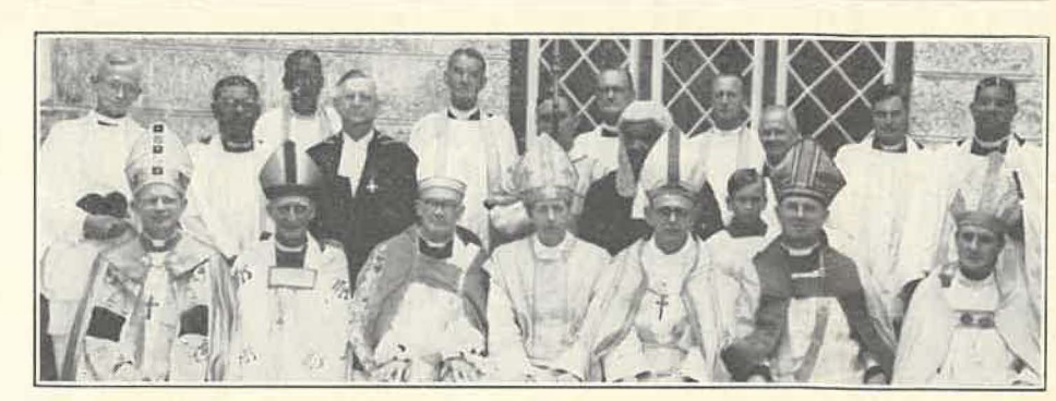
AMERICAN BISHOP* assists at West Indian consecration.

TUNING IN: ¶ The province of the West Indies is a self governing unit of the Anglican Communion with its own archbishop and Prayer Book. Anglicanism is strong numerically though weak financially in the British West Indies and many of the