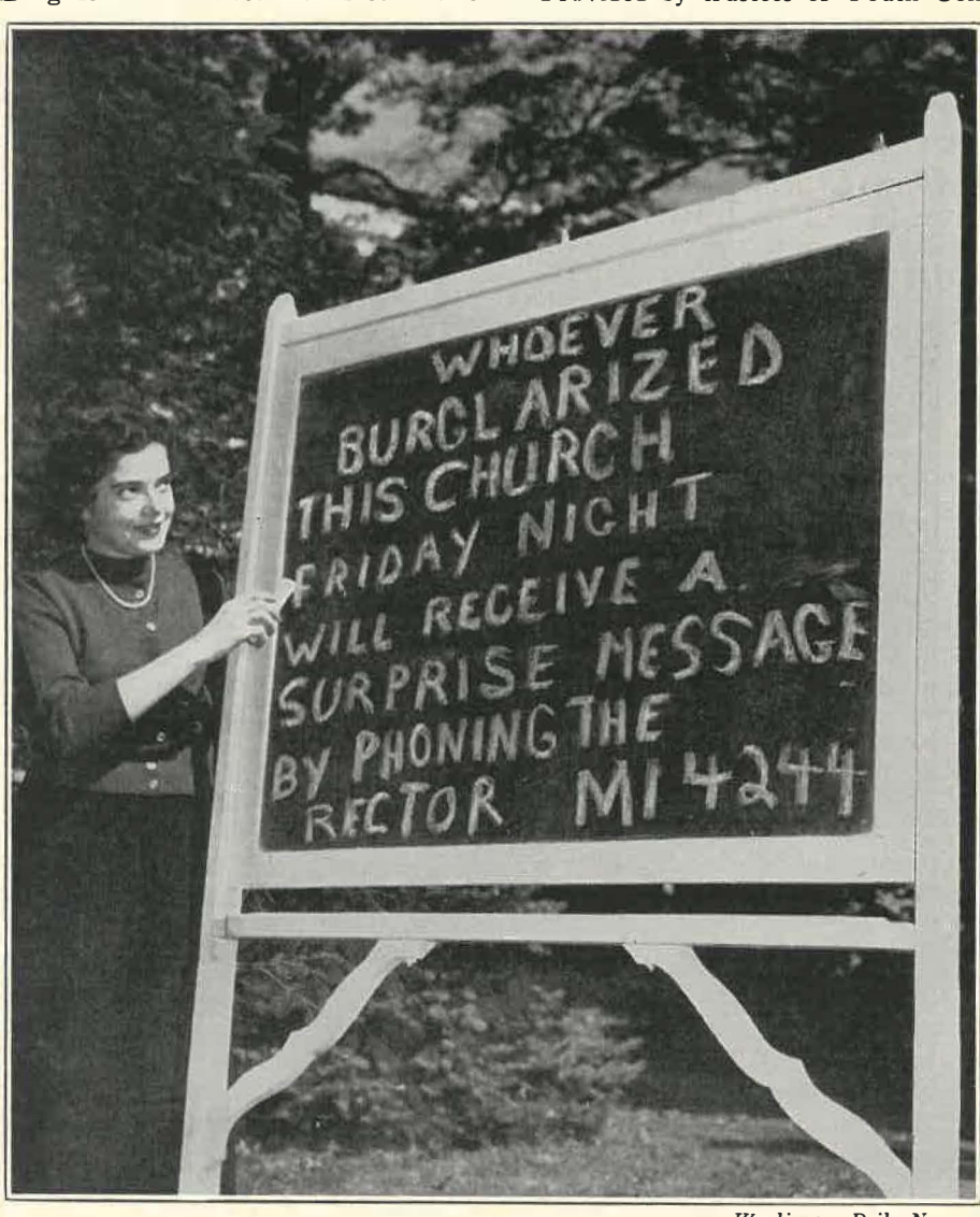
Washington Daily News