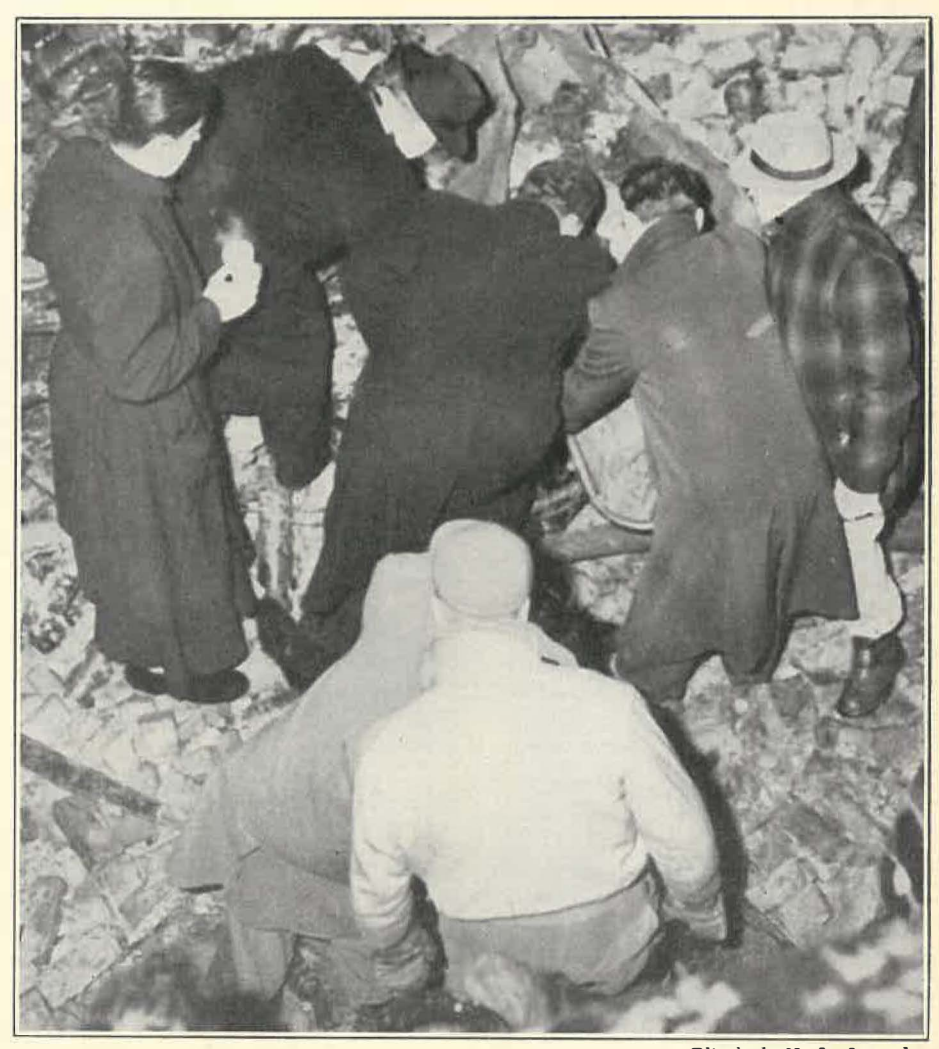
Elizabeth, N. J., Journal th dark hat).

tion, and this we still believe true. "In some passages the reply treats our letter as a request that our Church dissociate itself from 'The overall program' of NCC. But all that we requested was that our Church be dissociated from pronouncements and practices antagonistic to