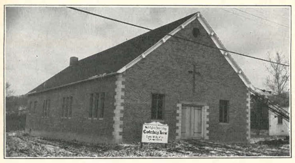
NEW CANTERBURY HOUSE: For students who will lead.