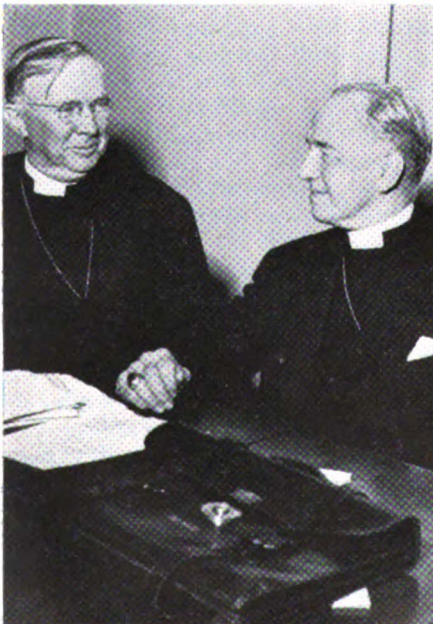
BISHOP CARRUTHERS AND GRAY Vocation, worship, message, work.

TUNING IN: Importance of rural work (alternately designated "Town and Country") is seen in the fact that over 50% of the more than 7000 parishes and missions of the Episcopal Church are located in communities under 10,000 in population.