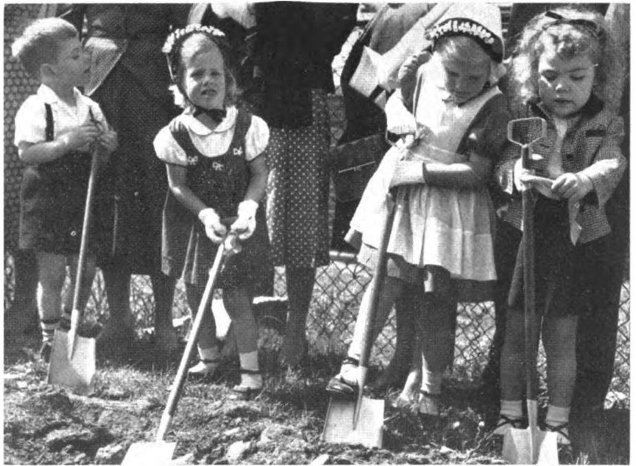
It took lots of push with 500 small feet on 500 shovels to break ground recently for the new Church school building for Christ Church, Grosse Pointe, Mich. The building, to house the Church school enrollment of 900, will cost more than $200,000. Christ Church is reported to be the seventh largest parish in the country and the largest suburban parish.

sion by the Presiding Bishop of the Episcopal Church."