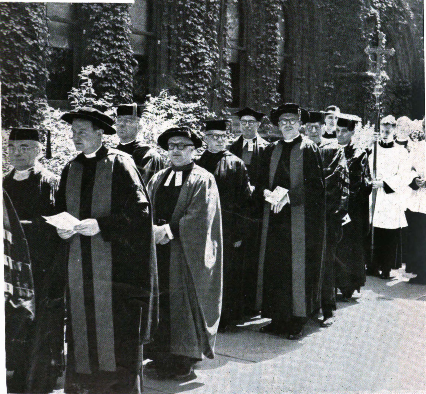
COMMENCEMENT DAY: Procession of faculty, GTS [