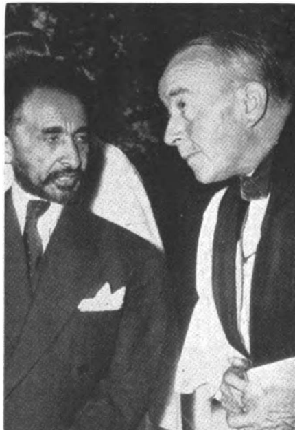
EMPEROR AND BISHOP Solid gold and blessings.

procession, in which the silver and gold cross presented by the Emperor to the cathedral in 1931 had already been given a place of honor.