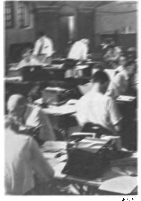
For every de egate, I a reporters.

e of a color. As it can more more meet out from the press reverse and more their way into the product attention along the termination of recipe and political and disported and factors and aports.