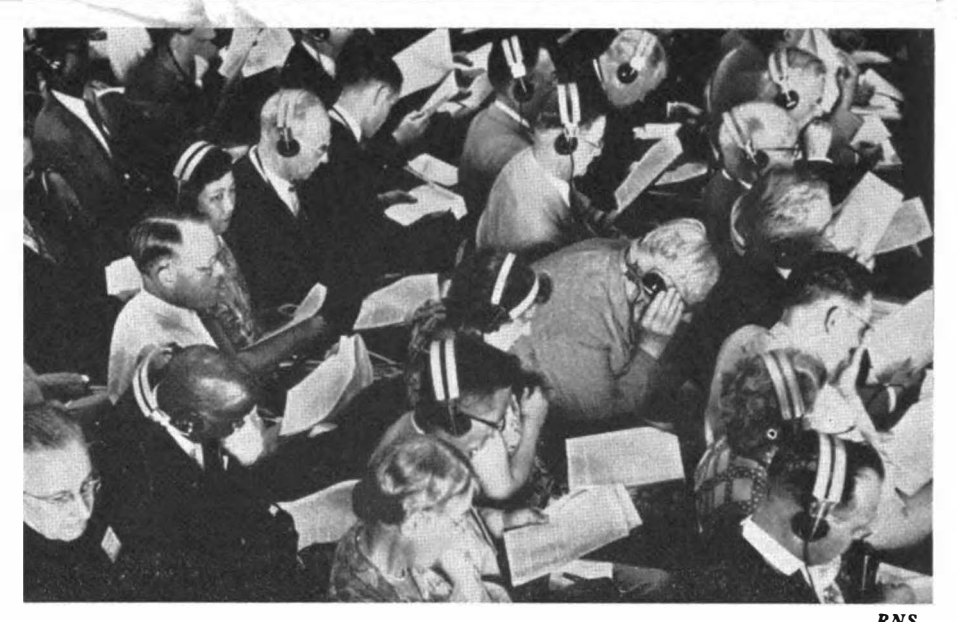
DELEGATES AND EARPHONES Tower of Babel and touch of Pentecost

*Many of them are pictured on this week's cover, at McGaw Hall, where sessions were held.