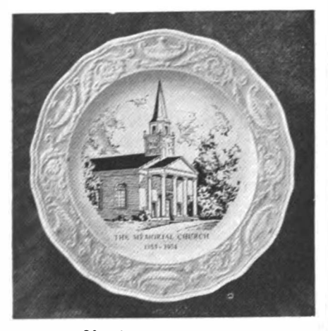
The Rembrandt of Pictorial Plates