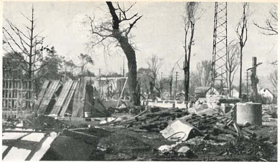
A HEAP OF ASHES is all that remains after fire destroyed St. Paul's Church, Odate, Japan.

ices, including the consecration of a bishop, and Dr. Ramsey addressed the congregation in about a dozen churches, where they had a warm welcome.