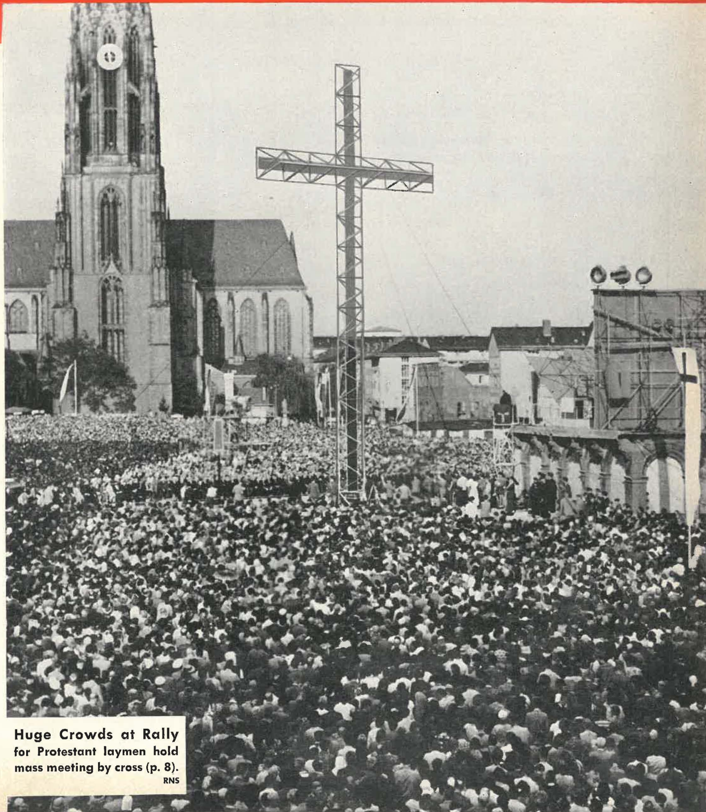
Huge Crowds at Rally for Protestant laymen hold mass meeting by cross (p. 8).