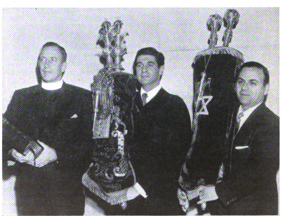
Religious News Service

ACU will again provide prayer leaflets for use in connection with parochial or personal observance of the week.