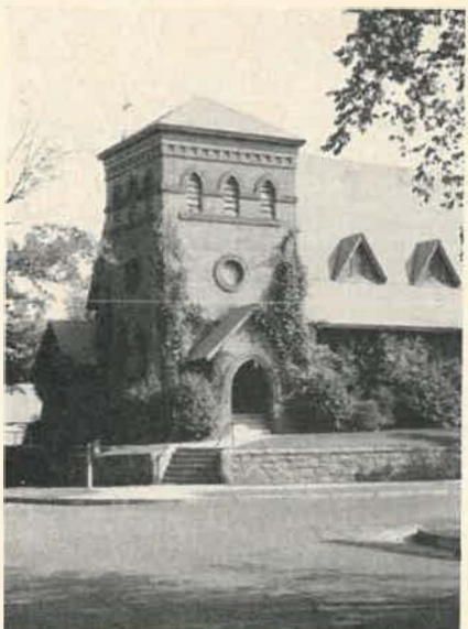
TRINITY CATHEDRAL LITTLE ROCK, ARKANSAS