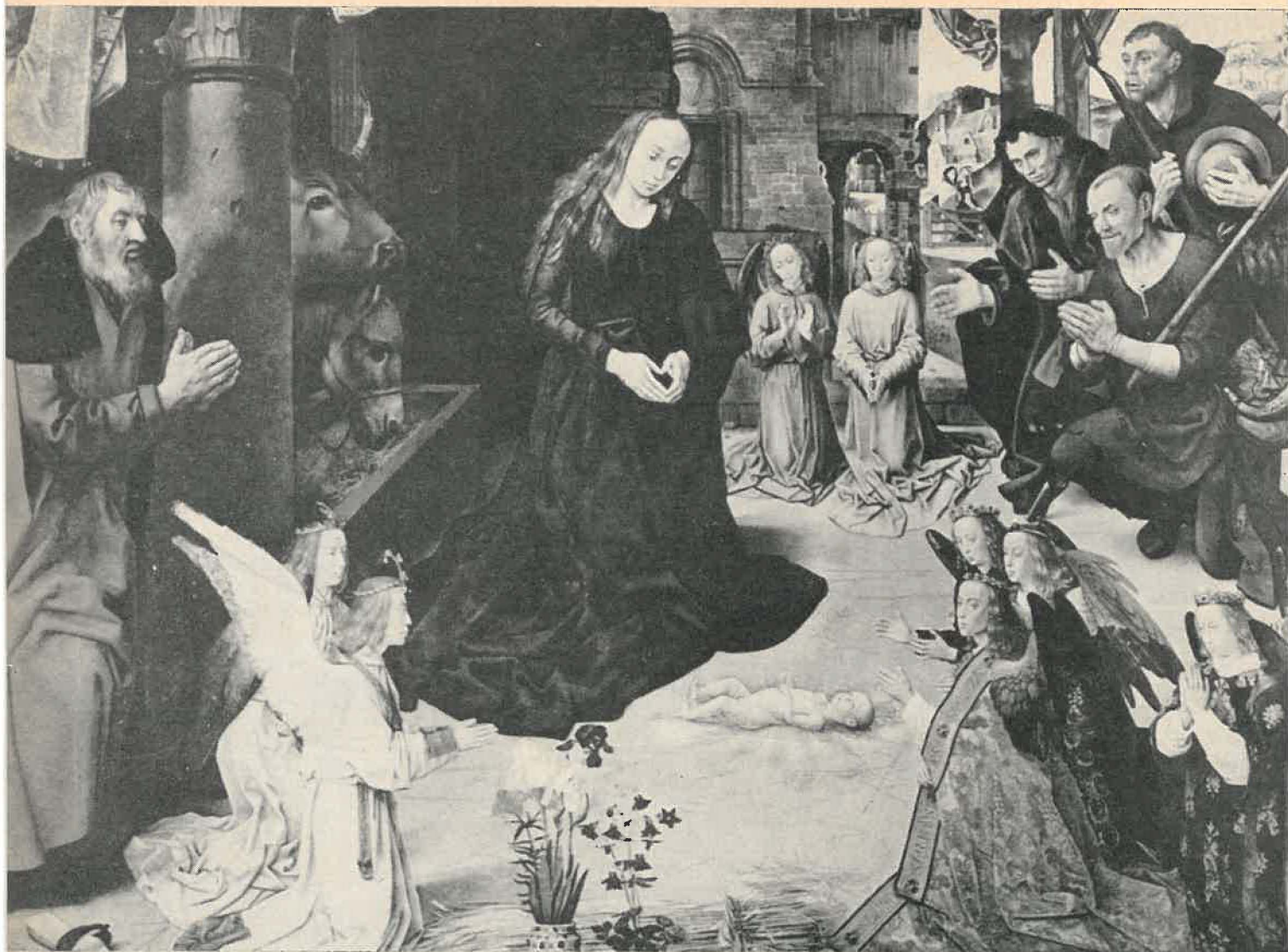
The Adoration of the Shepherds by Hugo Van der Goes An important place in Christian thinking and devotional practice.