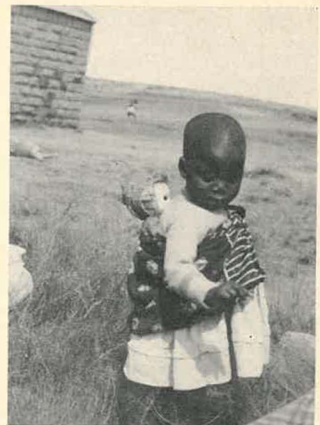
Worshipper in the Cape Province It's not all take.