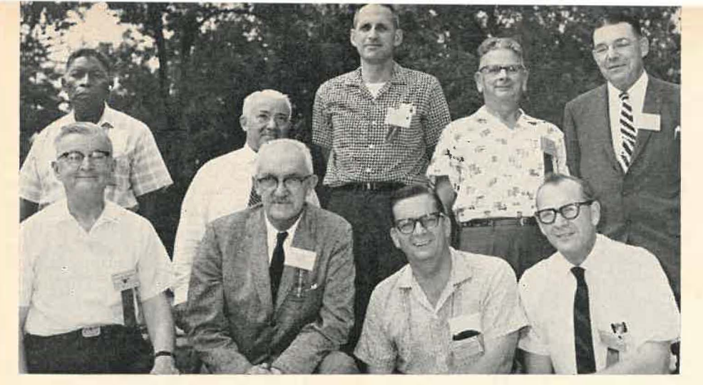
Dedication to the ideals of prayer, evangelism, and service.*

sion grants to teachers who choose to remain in grade one and two schools which become private will be withdrawn.