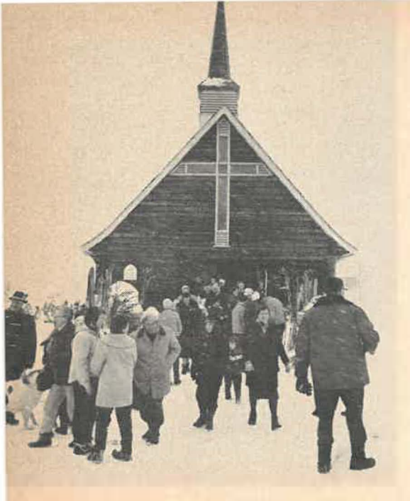
Skiers leave the Church of St. Francis of the Birds, in St. Sauveur, Quebec, after service.

Amid the snowy slopes, a dream fulfilled