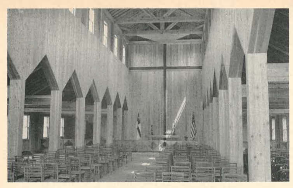
Lexington's new cathedral: The mountains shall sing.

dral domain has always been open to other Churches at times not scheduled for use by the Episcopal Church.