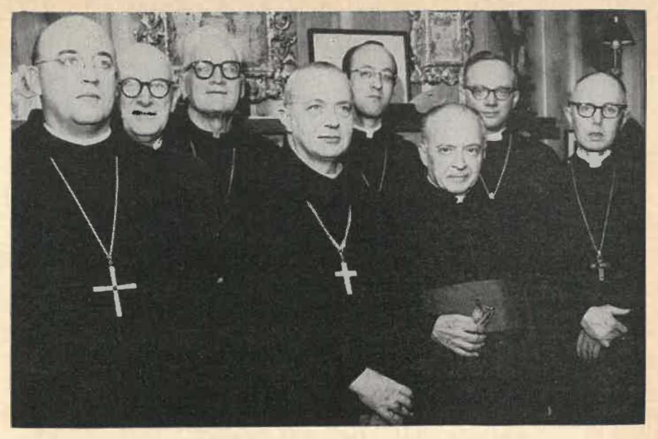
Benedictines and friends* at Three Rivers: A quarter century of service.

"Two stores I call 'super-supermarkets'—Gimbel's and Macy's—have within their buildings liquor stores, but you must go outside the main building and back in the liquor store section to make a purchase.