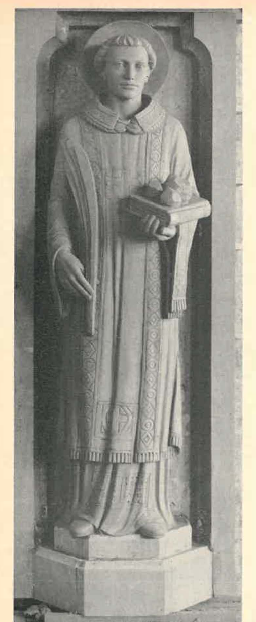
Surely Stephen wasn't stoned for waiting on tables.