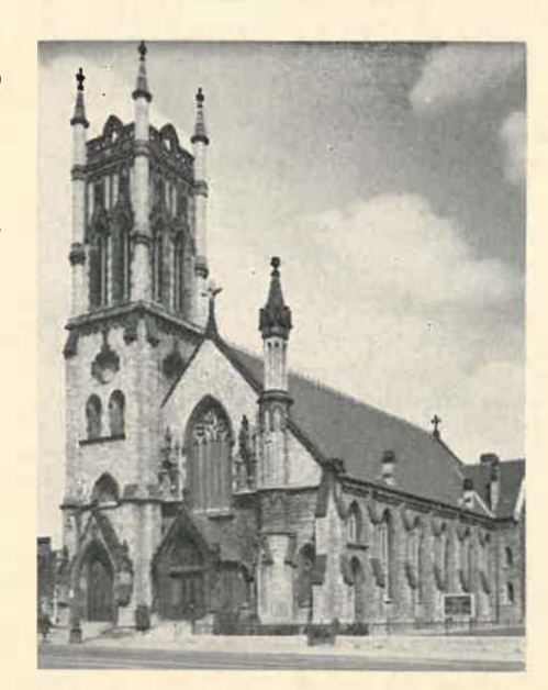
ST. JOHN'S CHURCH DETROIT, MICH.

HEAVENLY REST 5th Ave. at 90th Street Sun HC 9 & 15, 11, MP Ser 11 ex 15; Wed HC 7:30; Thurs HC & LOH 12 & 6; HD HC 12