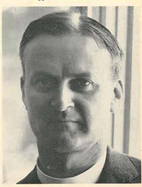
The Living Church