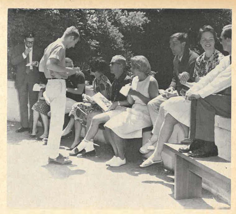
Members of the Stanford Canterbury group attend an informal luncheon after a Communion service.

A college campus is a kind of microcosm of the modern secular world, for it provides in concentrated form the things which tend to make the modern world a showcase of atheistic humanism. If it is true (and it is) that college students tend to be in rebellion against the religion of their childhood, one must remember that the religion they are in rebellion against is sometimes that of those who are content to have a Church to be only the bulwark of their way of life. It is not surprising that they experiment with agnosticism, atheism, and a relativist morality. Parish clergy often predict that their back-slidden college-age members will suspend belief only temporarily and that they expect them back in 10 years, after they have married, captured a good job, and started raising a family—after their