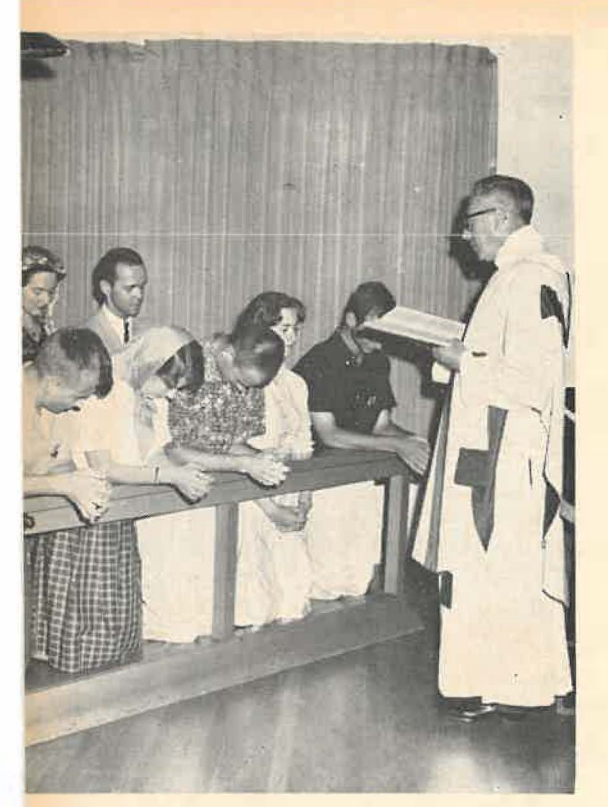
Mid-week Communion service at St. Anslem's Chapel, Stanford Canterbury House, Palo Alto.