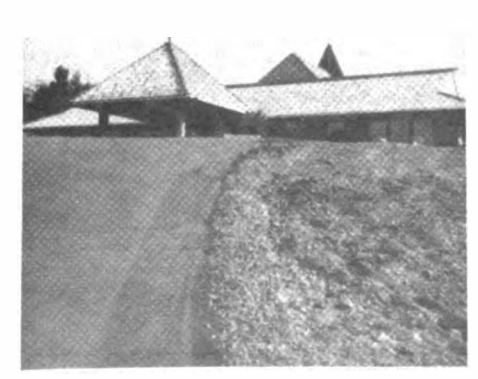
ST. JAMES' CHURCH LINCOLN CITY, OREGON