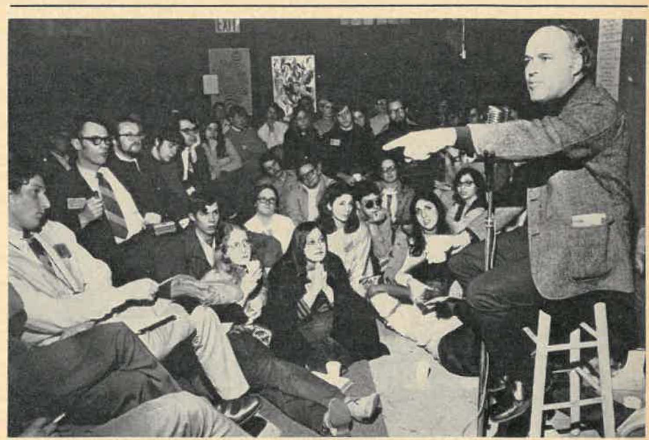
COFFEE HOUSE WORKSHOP

He has served on the national board of the NAACP Legal Defense Fund and as chairman of the Delta Ministry of the National Council of Churches, and is past president of the Washington Council