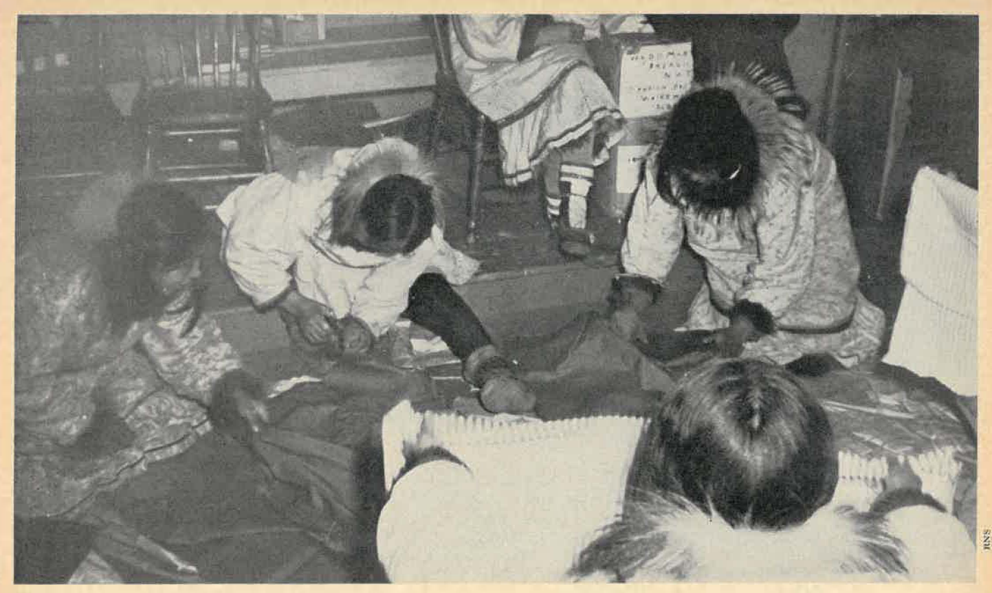
"Rightful occupation of the soil"—the women of an Arctic congregation meet to worship and work