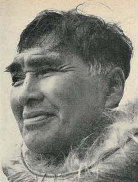
Alaskans—Churchmen have a priceless opportunity . . . .

1969 are on lands selected by the state without due recognition of the native-land rights.