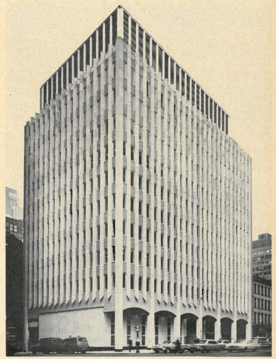
THE EPISCOPAL CHURCH CENTER IN NEW YORK CITY

HE Church Pension Fund has an enormous responsibility—providing benefits for its present 3,000 beneficiaries and for nearly 10,000 future clergymen, plus their families. This responsibility requires top-calibre leadership, sound money management and advisory services, and, just as important, an open-door policy to new ideas. And since the fund exists only for the benefit of our clergy, it is their responsibility to express their ideas and share the concern for making every improvement possible.