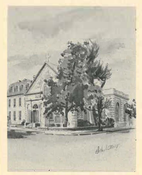
CHURCH OF THE HOLY COMMUNION CHARLESTON, SOUTH CAROLINA

Sun HC 8, 9:30, 11 MP & Ser; 4 Ev Special Music; Weekday HC Mon, Tues, Thurs & Fri 12:10; Wed 8, 1:10 & 5:15; Saints' Days 8. EP Mon, Tues Thurs & Fri 5:15. Church open daily 8 to 8.