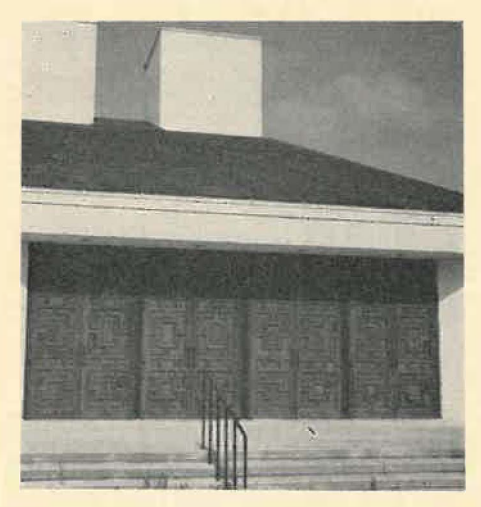
ST. LUKE'S CHURCH FORT MYERS, FLA.

Sun HC 8, 9:30, 11 MP & Ser; 4 Ev Special Music; Weekday HC Mon, Tues, Thurs & Fri 12:10; Wed 8, 1:10 & 5:15; Saints' Days 8. EP Mon, Tues, Thurs & Fri 5:15. Church open daily 8 to 8.