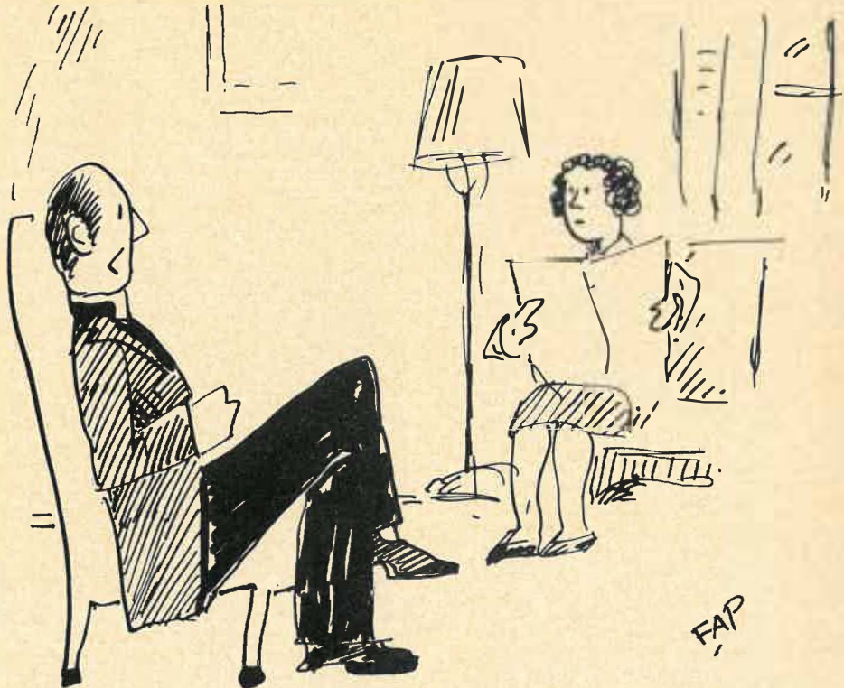
"First of all I'll rise to a spirited defence of the Executive Council's right to say things..., then I'll admit privately I wish they'd keep their mouth shut,"

A "must" for every serious church musician, be he choirmaster, organist, or singer. Excellent articles and materials. Naturally there is a Lutheran slant. Would that other churches would follow this lead!