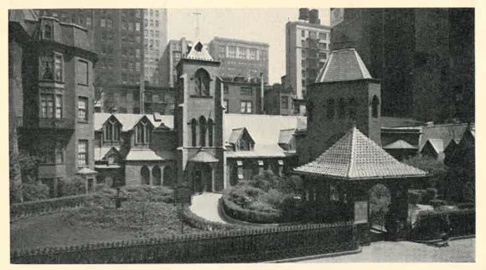
CHURCH OF THE TRANSFIGURATION "Little Church Around the Corner" NEW YORK, N.Y.

A Church Services Listing is a sound investment in the promotion of church attendance by all Churchmen, whether they are at home or away from home. Write to our advertising department for full particulars and rates.