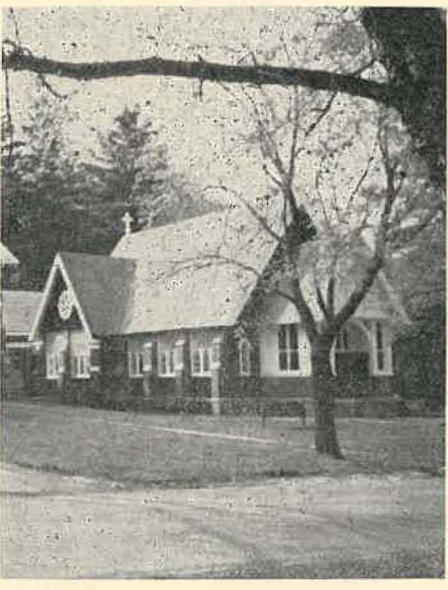
ST. LUKE'S CHURCH HOT SPRINGS, VA.

Sun 11. All services and sermons in French.