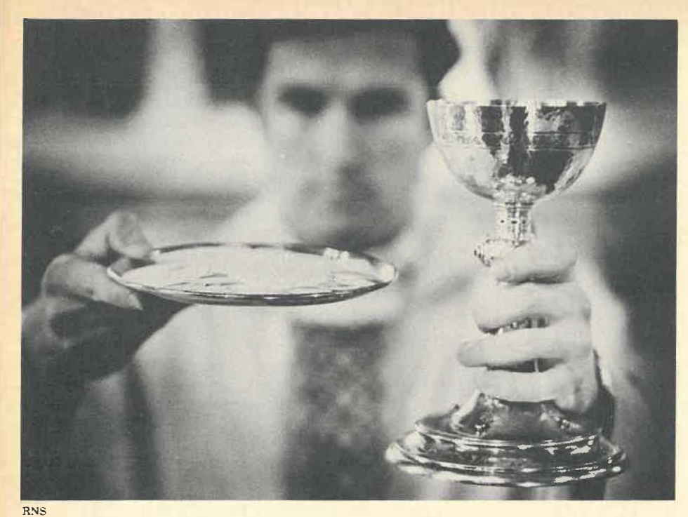
The eucharist: An occasion for renewal.

ministration, with a constant call on them for spiritual output, the clergy stand in permanent need of spiritual input. And with our chief pastors, the bishops, perhaps the need is greatest of all, even as the drain upon their spiritual resources is greatest. The committee on evangelism of the House of Bishops, meeting in Dallas recently, declared that "renewal in the church begins with the renewal of the bishops."