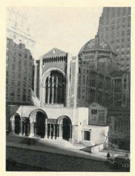
ST. BARTHOLOMEW'S CHURCH NEW YORK, N.Y.

Sun Masses 8:30, 11 Sol Mass; Tues \ensuremath{\mathcal{G}} Thurs 8; HD as anna; C by appt