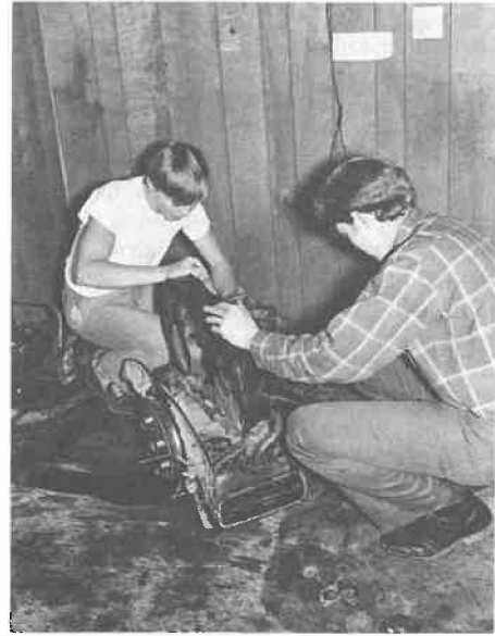
Two boys repair the engine of the VW used to carry the Farm's boys to school.

of land and contains a residence, cottage and shop, and a large garage. For the most part these buildings have been erected by the boys who have benefited from the farm.