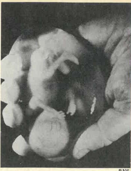
A 12-week-old human fetus: Is abortion the only alternative in terrible situations?

8. Abortion is, and has been, a luxury of the well-to-do or the reasonably well-to-do. In any case, medically safe abortions have been out of reach for the poor, for the "wretched of the earth." It has become evident, to the considerable chagrin of Western abortion zealots, that their ideology of abortion on demand is not finding a welcome home among the oppressed, among persons in the so-called "third world." Is it surprising that such an ideology appears to such persons in the