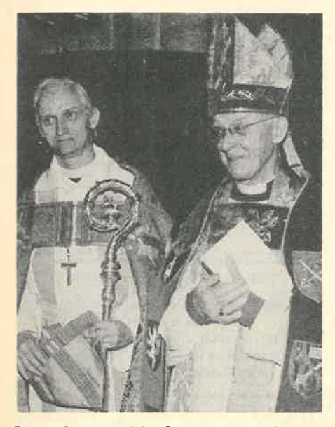
Bishop Gartner and Dr. Coggan at Trinity Institute; Preaching is an "awesome" task.

movement known as Episcopalians United, whose slogan is "No desertion — no surrender." Canon Osborn was accused at the meeting of not carrying out the policy of the organization. The accusation specified that he has publicly interpreted the "no desertion" phrase as meaning that regardless of what the General Convention does the ACU will stay in the church as ruled by the convention.