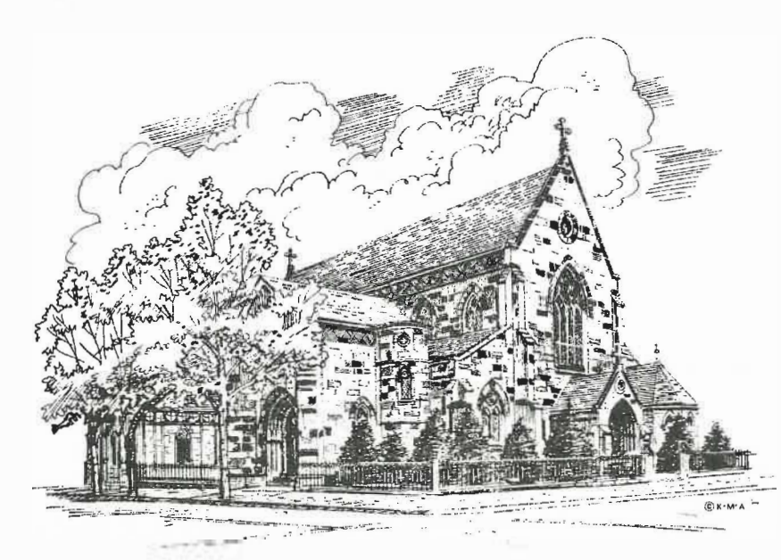
Grace and St. Peter's Church, Baltimore, Md.

"An Historic Landmark" Cor.: 2nd (Pa. Rt. 885) & Johnston Aves., & Gertrude St. — Hazelwood Sun Mass 8:30 & 10:15 (Sung). Weekdays as anno