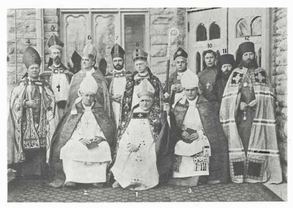
The most famous picture: "How would you caption this?"