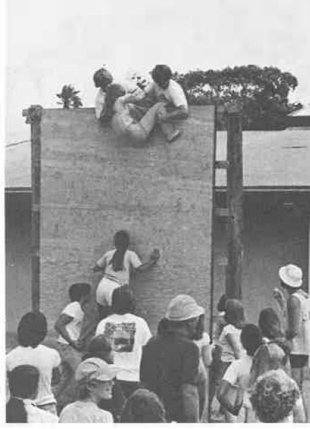
Teamwork is required to scale the 12' wall at Hawaii Preparatory Academy, Kamuela, Hawaii.

Coed gr. 7-12. For 175 students - gifted, average or with certain learning problems. Our noted Educational Evaluation Center identifies needs & capabilities, and individual programs are designed to achieve appropriate goals. Est. 1908. Fully accredited. Comprehensive Physical Education and Recreation Program. Six-week academic summer session June 19 through July 29.