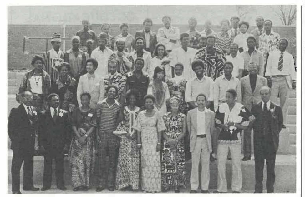
International students and college officials at Saint Augustine's College, Raleigh, N.C.

of tranquilizers and anti-depressants on birth defects in hamsters.