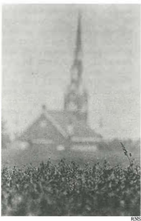
We shall be doing grave harm if we persist in forcing priests out of parishes because they have been there too long.

Currently, and short-range, then, the church is out of step in its regard for the older priest, to the extent that legal and moral considerations are being ignored. This writer knows of half a dozen priests of his acquaintance who have recently encountered difficulties because of their age, coupled with long tenure. The church has tackled the question of