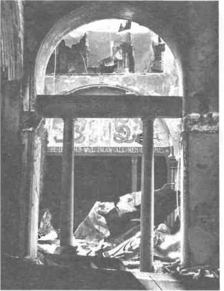
<sup>©</sup> Christopher Den Blaker, 1981

This measure, if passed, would define certain categories of British citizenship. "The basis of [full] citizenship as proposed by the bill was not being born