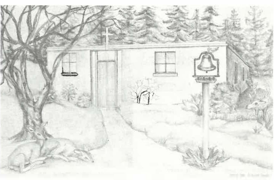
Great Falls Church, Great Falls, Va.

KEY — Light face type denotes AM, black face PM; add, address; anno, announced; A-C, Ante-Communion; appt, appointment; B, Benediction; C, Confessions; Cho, Choral; Ch S, Church School; c, curate; d, deacon; d.r.e., director of religious education; EP, Evening Prayer; Eu, Eucharist; Ev, Evensong; EYC, Episcopal Young Churchmen; ex, except; 1S, 1st Sunday; hol, holiday; HC, Holy Communion; HD, Holy Days; HH, Holy Hour; HS, Healing Service; HU, Holy Unction; Instr. Instructions; Int, Intercessions; LOH, Laying On of Hands; Lit, Litany; Mat, Matins; MP, Morning Prayer; MW, Morning Worship; P, Penance; r, rector; r-em, rector emeritus; Ser, Sermon; SM, Service of Music; Sol, Solemn; Sta, Stations; V, Vespers; v, vicar; YPF, Young People's Fellowship.