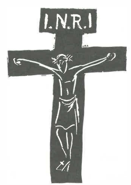
The Living Church

St. Paul said (Romans 8: 38-39), "For I am convinced that there is nothing in death or life, in the realm of spirits or superhuman powers, in the world as it is or as it shall be, in the forces of the universe, in heights or depths, nothing in all creation that can separate us from the love of God in Christ Jesus our Lord."