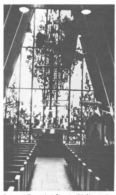
Protestant/Ecumenical Chapel, JFK Airport, New York, N.Y.

ST. PAUL'S Broadway at Fulton Sun HC 9; HS 5:30 (1S & 3S); Mon thru Fri HC 1:05