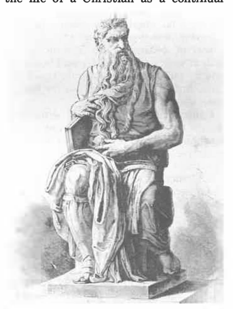
Moses (by Michelangelo): A model of growth in wisdom and virtue

St. Gregory of Nyssa (335-395) saw the life of a Christian as a continual