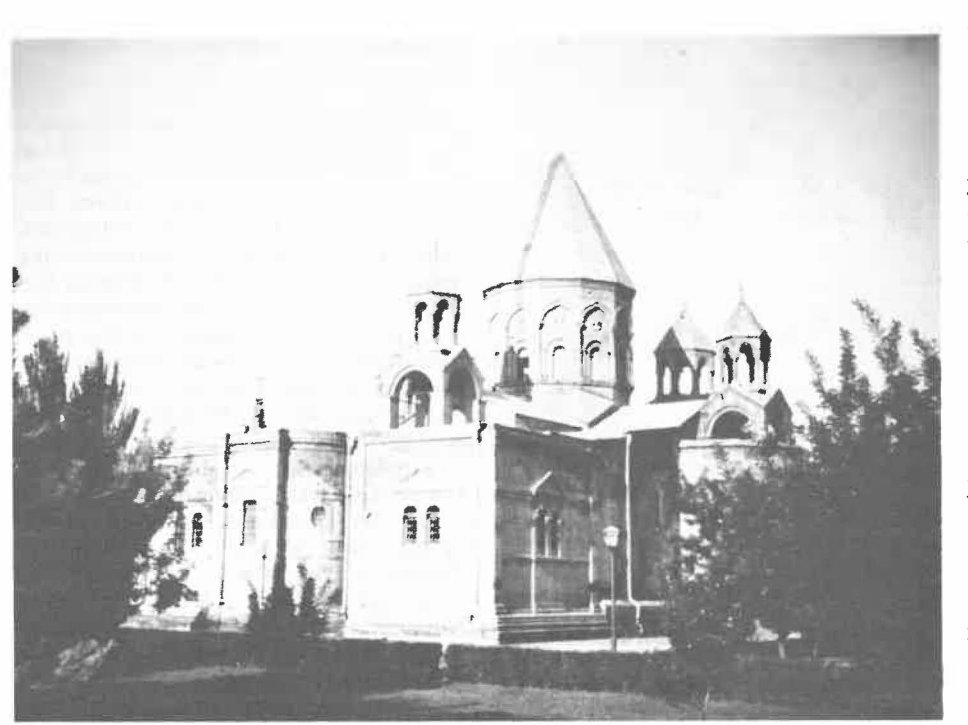
Etchmladzin Cathedral, Etchmladzin, Armenia.

Armenian bishops and delegates, numbering in the hundreds, came from parishes and dioceses in Australia, South America, Canada, Great Britain, the U.S., western Europe, and the Mid-