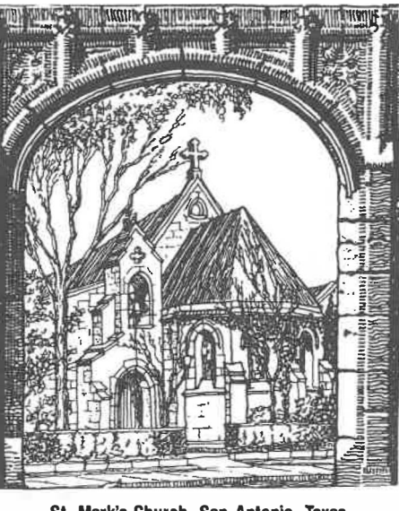
St. Mark's Church, San Antonio, Texas

Sun Masses 8 & 10:45 (Sol). Daily: Low Mass 7, also Wed 9:15. Matins 6:45, EP 5:30; C Sat 5