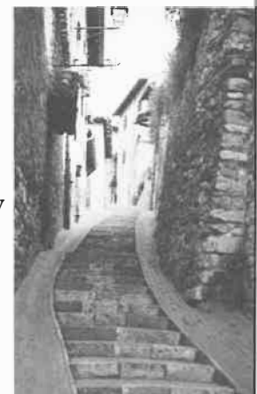
The streets of Assisi are narrow and winding