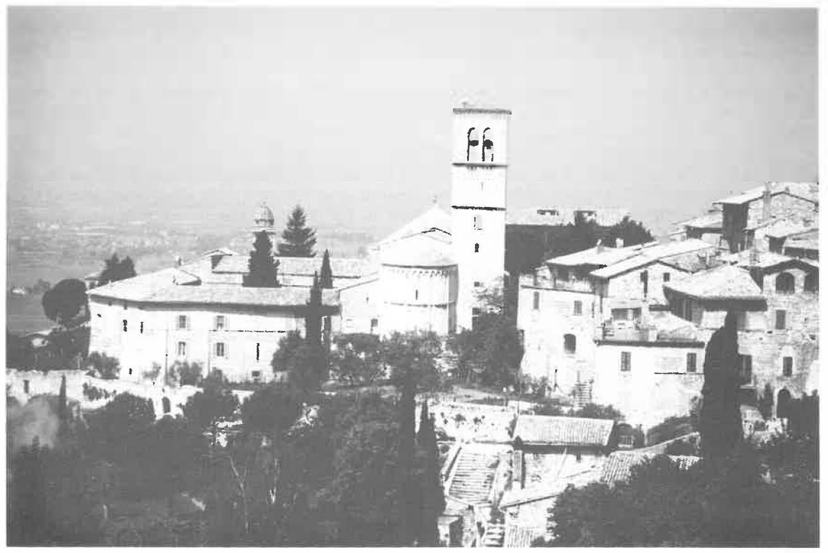
Assisi, viewed from the Basilica of St. Clare. In the center is the Benedictine Abbey and Church of St. Peter.

A visit to Assisi is a religious pilgrimage